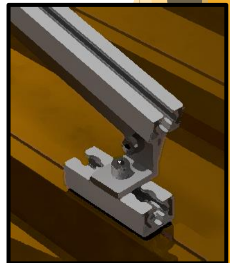
Integration with Angled Frames