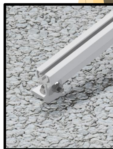
Integration with Angled system connection