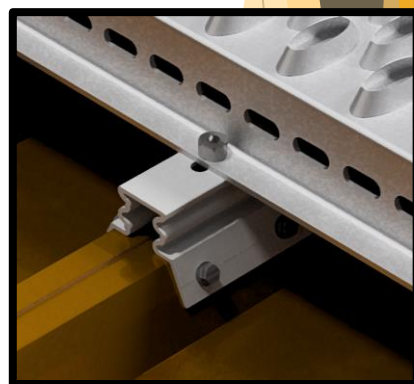
Integration with Walkway