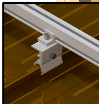
Integration with Railed system connection