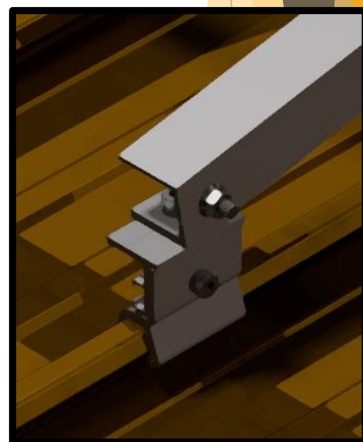
Integration with angled system