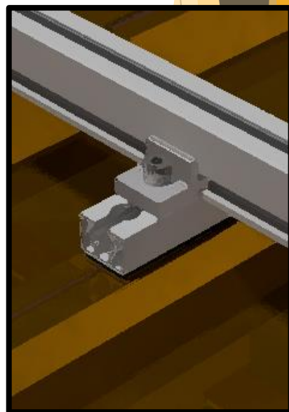
Integration with Rail